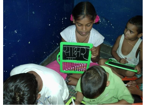
Children at Sakshar school run by VVF

The Vigyan Vijay Foundation was established as a result of several rounds of deliberations among three engineers and a sociologist of New Delhi who shared a common vision: to assist individuals, communities and organizations to harness the benefits of Science and State of the Art Technology, and use it to improve the quality of life. Several meetings and consultations later and with two more engineers and a doctor, The Vigyan Vijay Foundation was registered as a Society, under the Societies Registration Act XXI of 1860 on 3 rd September, 2001 (No. S-40224).